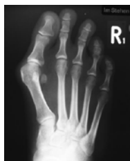
X-ray examination of a bunion